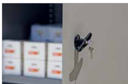
The doors include a lock with two keys.